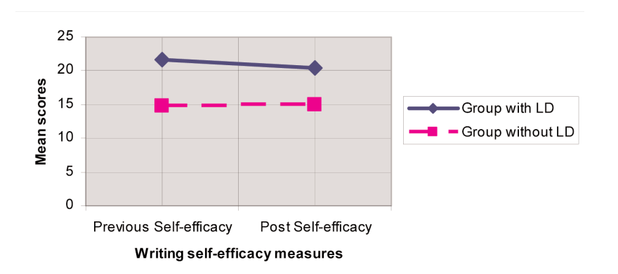
Figure 1 . Significant differences of writing self-efficacy measures between the groups of typical students and the group of students with learning disabilities.