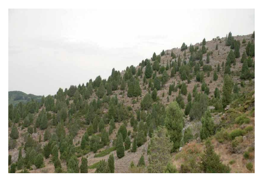
Figure 6. Climax and chamephytic serial stage of an edaphoxerophilous vegetation series. Juniperetum sabinothuriferae, Lithodoro diffusae-Genistetum scorpii. Mirantes de Luna (León, Spain) .

The temporihygrophilous , mesophytic and mesohygrophytic vegetation series have extraordinary hydric contributions due to topographic reasons. These series develop in slightly flooded or very humid soils only part of the year. The soil horizons are well drained or aerated at least during the summer or the dry season.