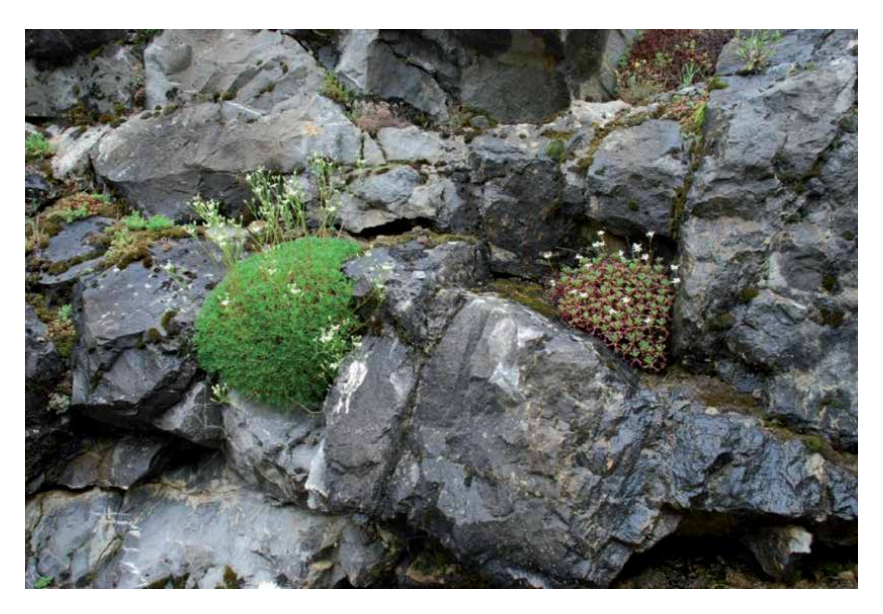
Figure 11. Rupicolous permaseries (Centrantho lecoqii-Saxifragetum canaliculatae). Beberino (León, Spain).

It is the case of a freshwater lagoon geopermaseries in which the persistence of water is not constant throughout the year. It undergoes partial or total desiccation during the summer because it loses the water table throughout the spring to recover it in autumn and having its maximum during winter ( Figure 12 ).