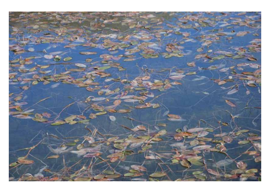
Figure 9. Lacustrine permaseries (Potamogetum natans plant community). Villadangos del Páramo (León, Spain).

stratified, lacking of perennial non-nitrophilous substitution communities. It means that, apart from the annual or ephemeral species and communities that may temporarily establish in the open or degraded spaces of such locations, it is only the perennial plants that participate in the mature community that can thrive to reorganize the same permanent plant community [49] (Figures 8–11).