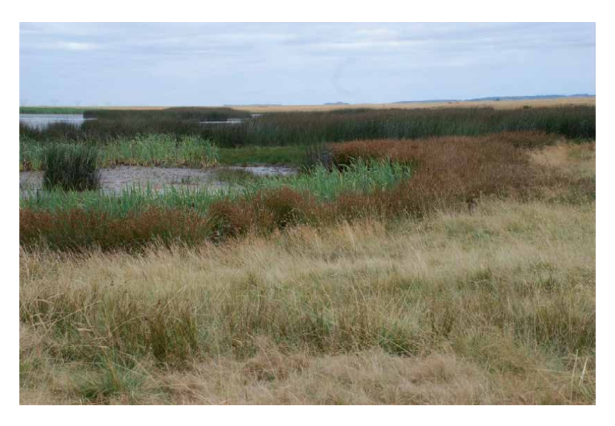
Figure 12. Lagoon geopermaseries. Valdepolo León, Spain.

Let us suppose a beech forest in southern exposure, at the limit of its distribution area between the Eurosiberian and Mediterranean region and therefore in a temperate oceanic bioclimate with a submediterranean variant, that undergoes a regressive