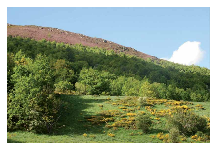
Figure 1. Climax and serial stages of a climatophilous and acidophilous beech forest. Blechno spicant-Fagetum sylvaticae; Cytiso cantabrici- Genistetum polygaliphyllae; Pterosparto cantabrici-Ericetum aragonensis; Merendero pyrenaicae-Cynosuretum cristati. Cofiñal (León, Spain).