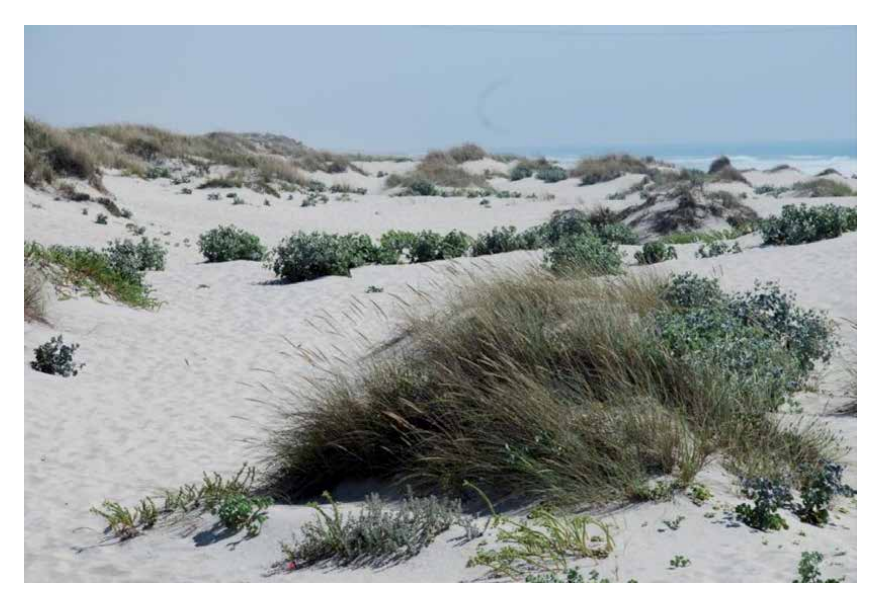
Figure 8. Geopermaseries of dune systems (Ammophiletea australis). Troia Peninsula (Portugal).