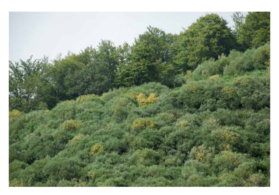
Figure 2. Forest (Blechno spicant-Fagetum sylvaticae) and nanophanerophytic shrubland (Cytiso cantabrici-Genistetum polygaliphyllae). Riaño (León, Spain).

This model or sequence of serial stages is defined as vegetation series in the Dynamic-Catenal Phytosociology. It is also known as sigmetum , sigmeto (Spanishize) or sinassociation . It expresses the entire set of plant communities or steps that can be found in related tessellated spaces (superholotesela) as a result of the process of succession, which includes both the association representative of the mature and series head, like initial or subserial associations that can replace it.