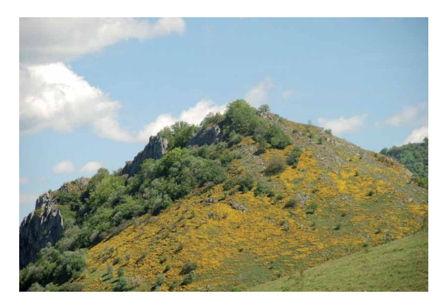
Figure 3. Climax and serial stages of an edaphoxerophilous and basophilous beech forest. Epipactido helleborines-Fagetum sylvaticae, Lithodoro diffusae-Genistetum occidentalis and Helianthemo cantabrici-Brometum erecti. Bernesga Valley (León, Spain).