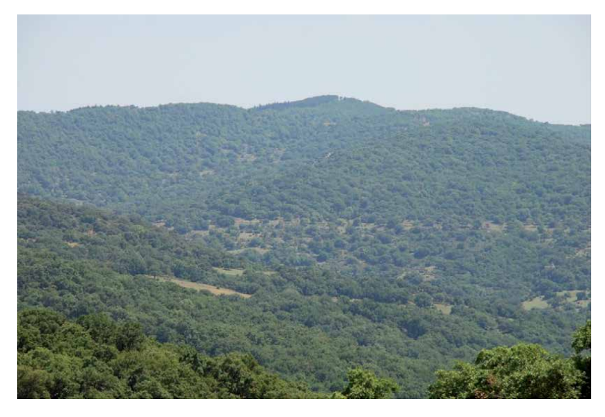
Figure 5. Teucrio baetici-Quercetum suberis, head series of the aljibic climatophilous and acidophilous cork oak forest.