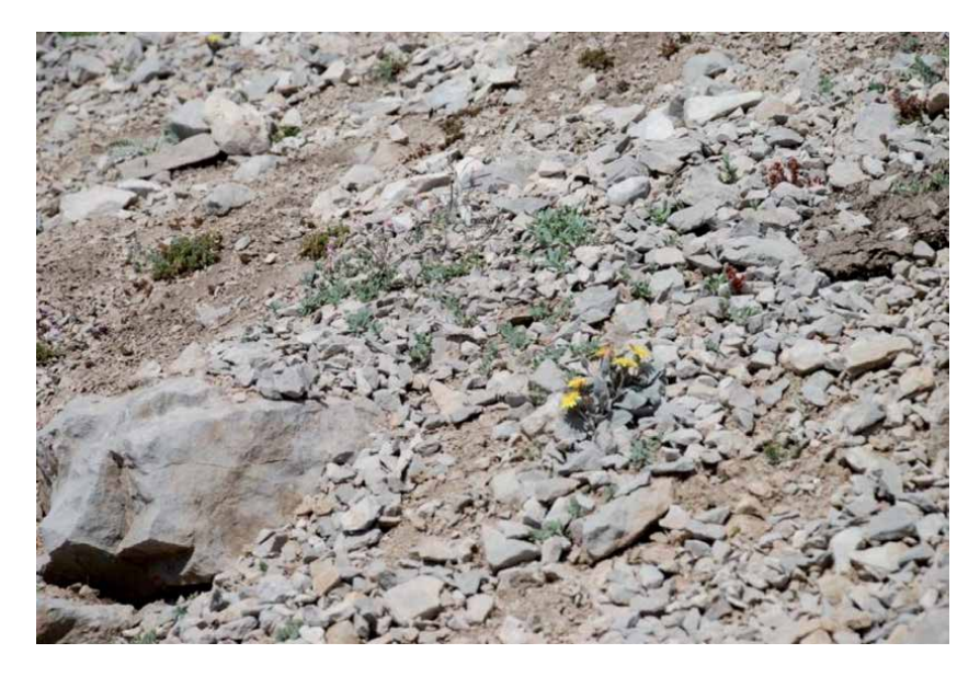
Figure 10. Glericolous permaseries (Linario filicaulis-Crepidetum pygmaeae). La Vueltona (Picos de Europa, Spain).