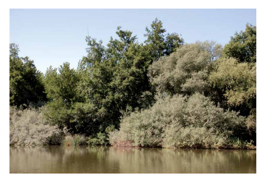
Figure 7. Climax of an edaphohygrophilous vegetation series. Populo nigrae-Salicetum neotrichae. Benavente (Zamora, Spain).

There are other different models apart from the aforementioned vegetation series in the Dynamic-Catenal Phytosociology. Minoriseries of vegetation or minorisigmetum (Latinized expression) are plant communities with their corresponding perennial and annual substitution stages. These are found in the tessellated spaces and in their jurisdictional territories but that by exceptional environmental causes do not reach, in progressive succession, the mature stage of the habitual climatophilous or edaphophilous series head in the corresponding biogeographic and bioclimatic environment.