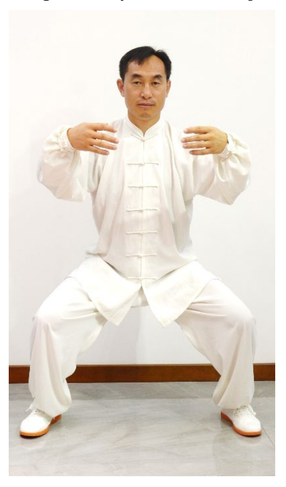
Figure 1. Basic posture of chan chuang .

Once practitioners have acquired a grasp of the fundamental elements, they shift their focus from the physical aspect to the intention; seek strength in the absence of energy; find movement within stillness; seek stillness within movement; seek integration within emptiness; and seek forgetfulness within integration. By standing in a confined space, they endeavor to connect with nature and embrace a state of non-action.