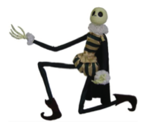
Figure 4. Othello Jack figure