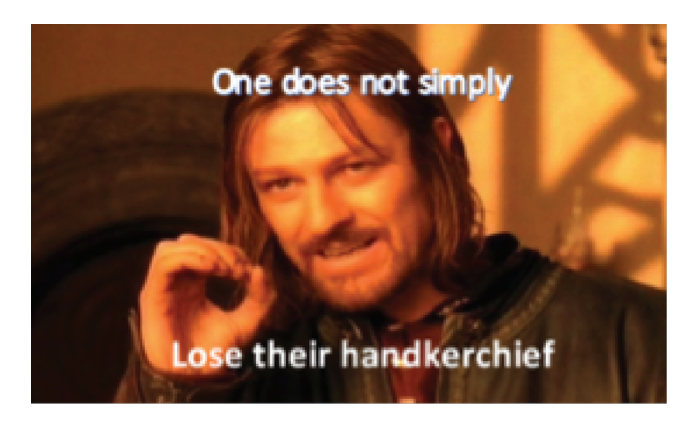
Figure 3. An Othello meme based on the "One Does Not Simply Walk into Mordor" meme