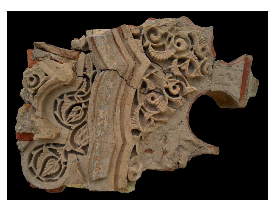
FIG. 4 Oratory of Aliafería. Plaster decoration. Zaragoza, Aliafería palace (Cortes de Aragón). Photo: Víctor Rabasco

FIG. 5 Arch fragment of Castell Formós palace, Polychrome plaster on brick arch. Balaguer, Museu de la Noguera. Photo: Víctor Rabasco