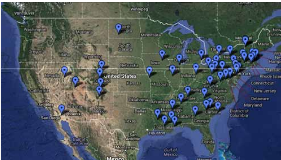
Fig. 1. Map of National Heritage Areas in the United States. Since the 1980s, forty four national heritage areas have been implemented for only ten new national parks

Also, management guidelines and projects are only made publicly available in exceptional cases (e.g., Casas, 2006). Not only there is a lack of interdisciplinary