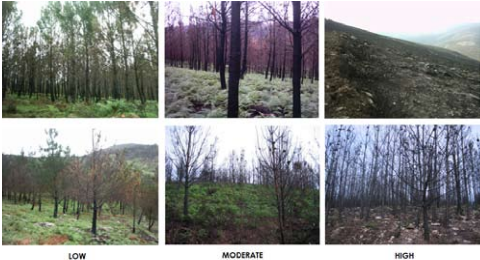
Figure 1. Low, moderate, and high post-fire effects in Galicia (NW Spain) (from right to left). Classified via consistent visual assessment of ground, understory and canopy fire effects, according to the protocol adapted by CIF Lourizán using FIREMON as reference.

Therefore, each severity level resulted in the following characteristics, considering effects in soil, understory and canopy (Table 1).