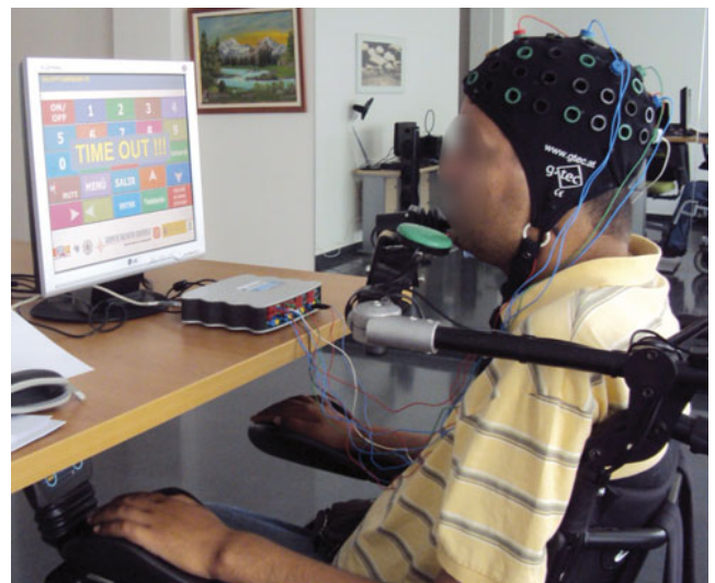
Figure 1 User carrying out test on the BCI system

Finally, for the evaluation of attention-concentration, verbal and non-verbal tasks were used. The neuropsychological profile of each participant was thus established. Each participant used a Brain Computer Interface (BCI) cap, which translates the subject's intentions, collected via electrodes in contact with the scalp, into control commands for a device. P300 potentials, detected from the EEG signal, were used due to their greater simplicity for users and their not requiring a prior stage of intensive training. A portable, 16-channel biomedical signals amplifier with g.tec USB connection (Austria) was used to record the EEG signal. The reduced dimensions and weight of this device facilitated its portability. The recording equipment was completed with a cap-like device on which the electrodes are placed and worn on the head with the electrodes located in specific areas of the cortex. g.LADYbird (g.tec) active electrodes with a g.GAMMAbox (g.tec) low noise preamplifier, g.GAMMAconnector means of connection and g.GAMMAcap2SET (g.tec) caps were used in this study. The BCI system detected the correct cerebral pattern in the participant's cerebral activity, taking into account that if the subject did not achieve the objective, the visual feedback allowed them the possibility to maintain or change their strategy ( Figure 1 ).