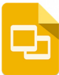
Google Slides Google Inc.