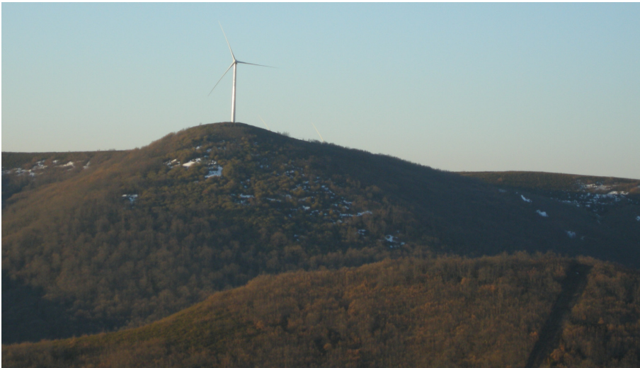
Figure 2. Wind turbine of the “Valdesamario” wind farm above the Mediterranean Quercus pyrenaica oak forest. Winter 2011. Author: Manuel A. González. [Molino eólico del parque eólico “Valdesamario” sobre melojar mediterráneo Quercus pyrenaica . Invierno 2011. Autor: Manuel A. González.]

We found significant differences in the number of presence signs before and after the construction of the wind farm (T test T = 3.15 , P = 0.01 ) but not in the number of points with presence before and after (T test T = 1.83 , P = 0.1 ). Before the construction of the wind farm, points with presence ( n = 64 ) were detected in each survey, whereas after the construction, points with presence ( n = 21 ) were only found in the first of five surveys and decreased to zero. Globally we detected 178 presence signs ( i. e. droppings, feathers and footprints) before and only 34 ( i. e. droppings) after construction. Five direct sightings (twice a hen and a cock the remaining, Figure 3) were registered before with a minimum of five different birds frequently