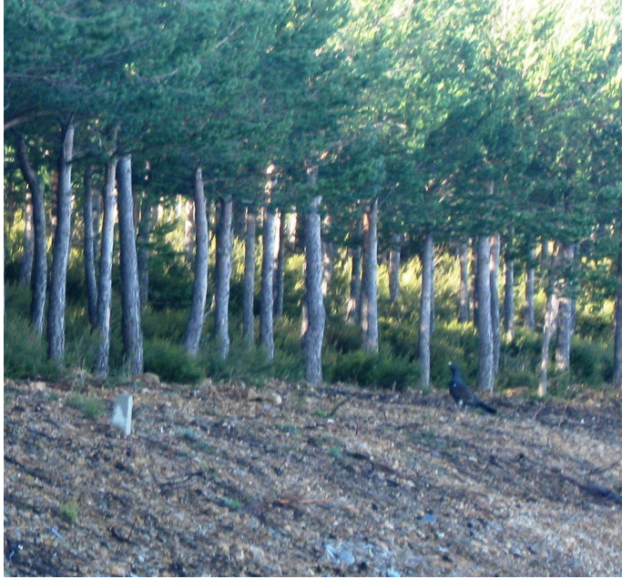
Figure 3. Cock in the border of the traffic-path of the “Valdesamario” wind farm. Winter 2009. Author: Manuel A. González. [Urogallo en el borde de la pista del parque eólico “Valdesamario”. Invierno 2009. Autor: Manuel A. González]

using the circuit and none bird was seen in surveys after construction. Every point with sightings showed also presence signs (droppings, feathers and/or footprints). Along the circuit 4 km long points with Capercaillie signs summed up to 3250 m (median 550 m; range 400-950 m) before and 1050 m (median 0 m; range 0-1050 m) after. 91% of the presence signs detected before were droppings and 9% trails on the snow, otherwise, after construction every sign corresponded to droppings. Feathers were anecdotic (see Table 1).