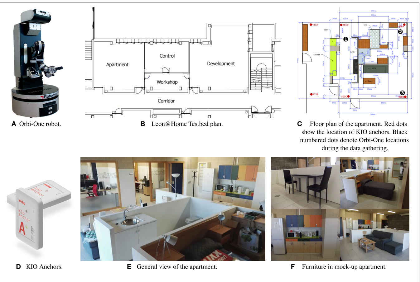
FIGURE 1 | Materials used in the experiments. (A) Orbi-One robot. (B) Leon@Home Testbed plan. (C) Floor plan of the apartment. Red dots show the location of KIO anchors. Black numbered dots denote Orbi-One locations during the data gathering. (D) KIO anchors. (E) General view of the apartment. (F) Furniture in mock-up apartment.

<sup>4</sup>http://www.robotnik.es/manipuladores-roboticos-moviles/rb-one/.